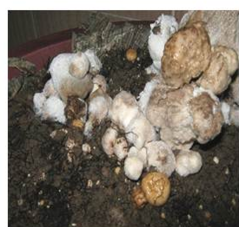
Symptom development after inoculation

* Figures are the per cent infected sporocarps