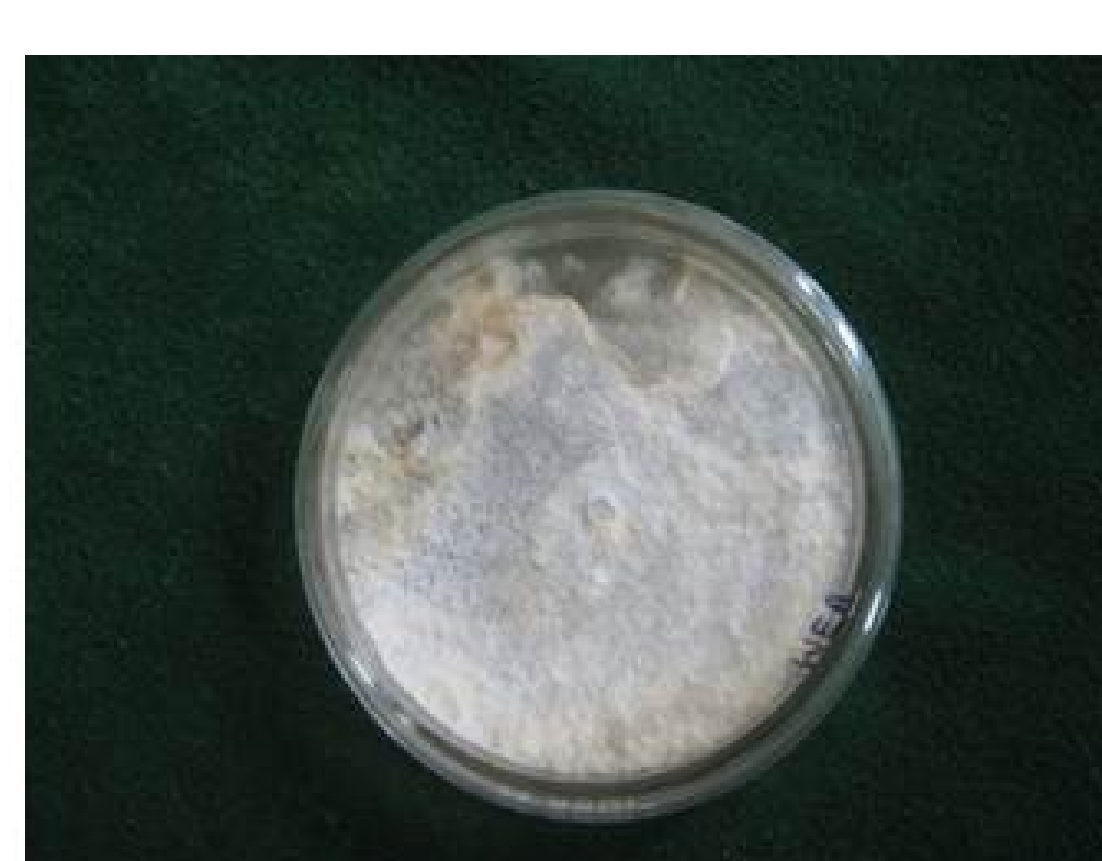
Mycelial growth on MEA