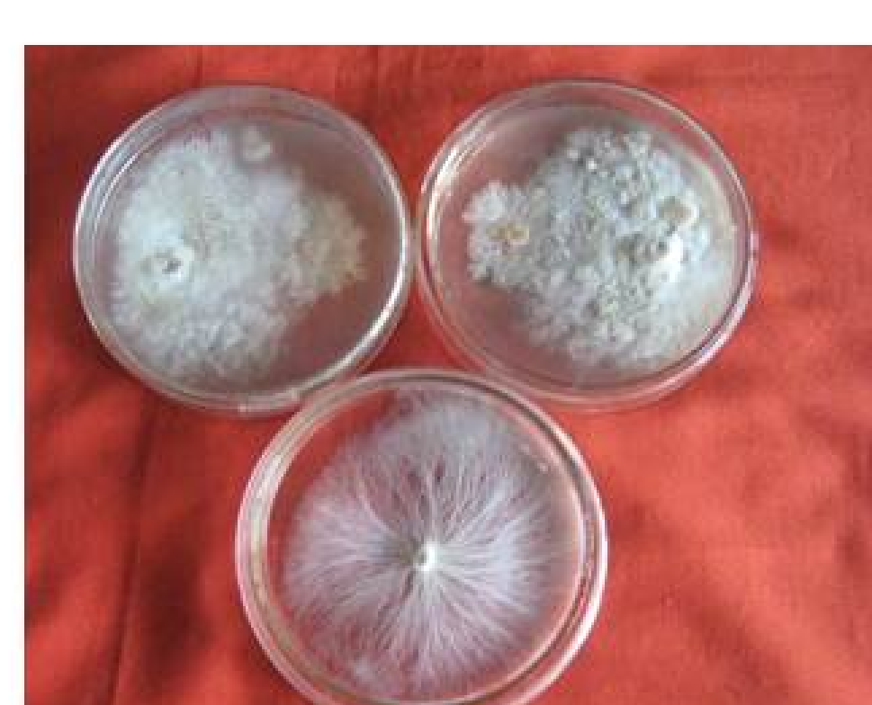
Dual culture of Mycogone perniciosa and Agaricus bisporus