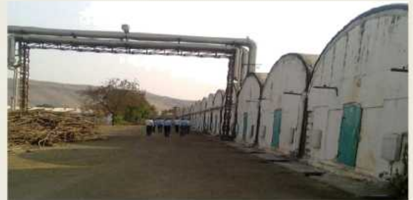
2. A COMMERCIAL FARM