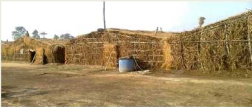
1. A SEASONAL FARM