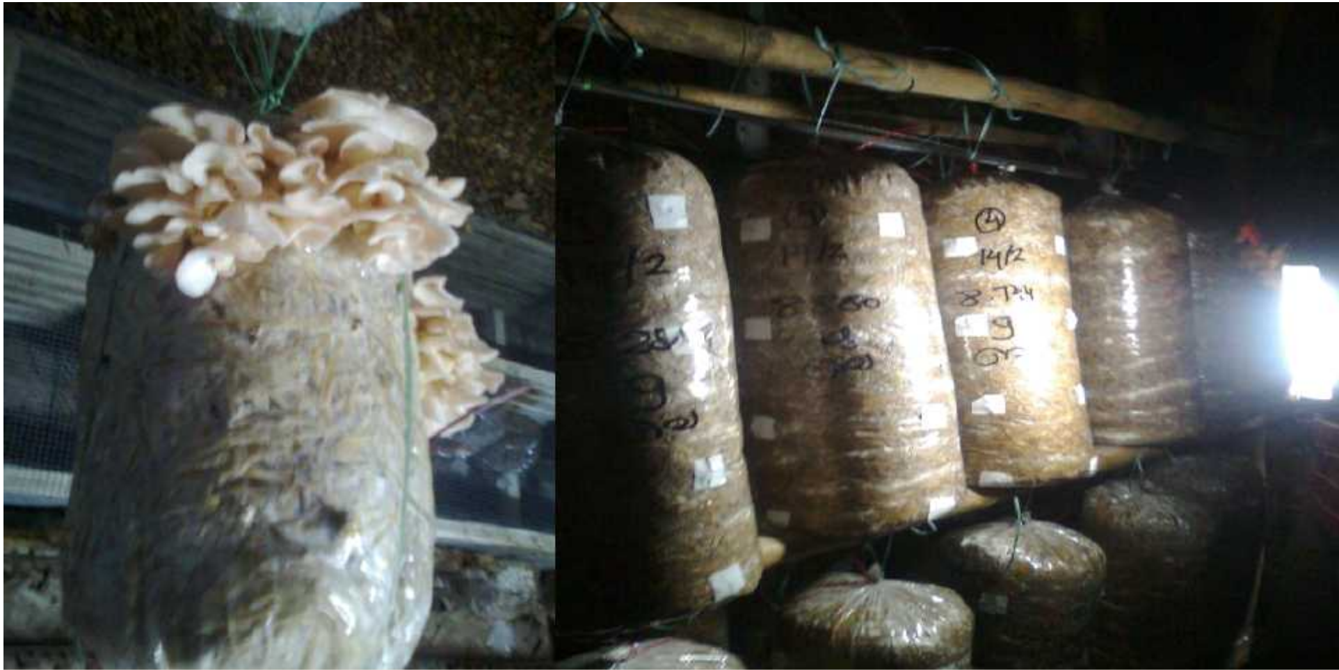
OYSTER MUSHROOM GROWING ON CYLINDRICAL BEDS