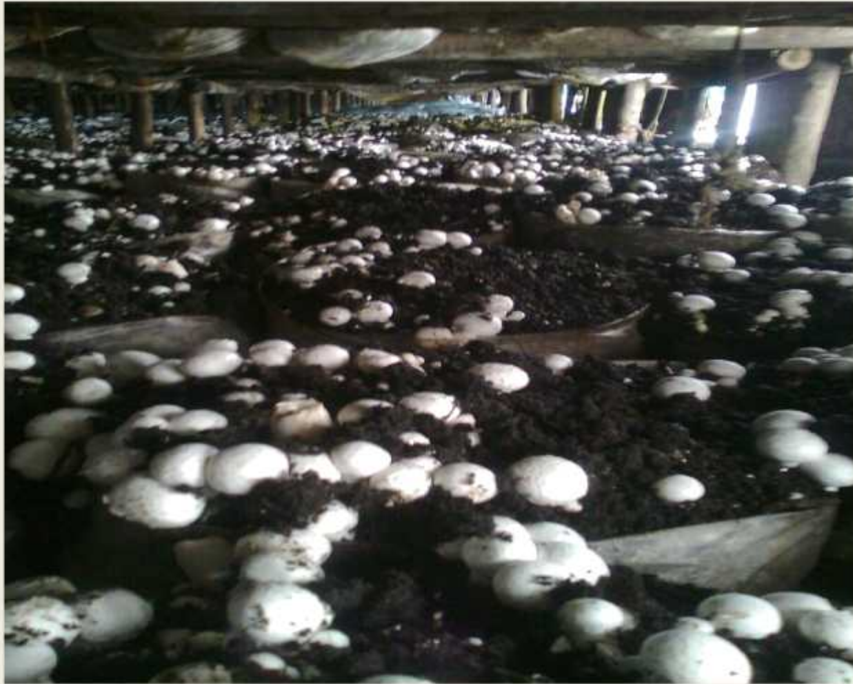
A SEASONAL BUTTON MUSHROOM FARM